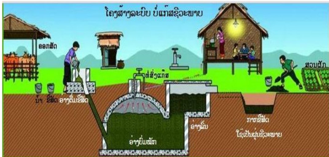
Picture: A Sketch of a Biogas System