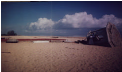
After the tsunami - The Shrine of Our Lady of Veilankanny, March, 2005

In 2004, there were two orphanages sheltering about 50 children, a result of over 20 years of ongoing civil war.