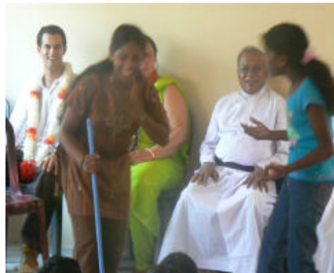
A play , presented by two of the Ashram residents. Plays such as these are integral to education in rural Sri Lanka, and carry far more status in the communities than they would in Australia.