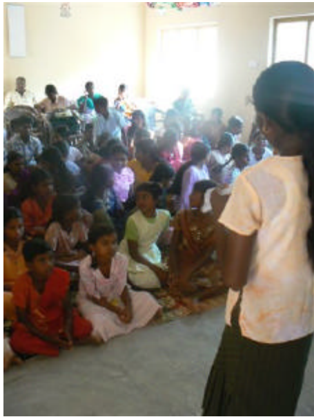
Thank yous are given during the opening speech.