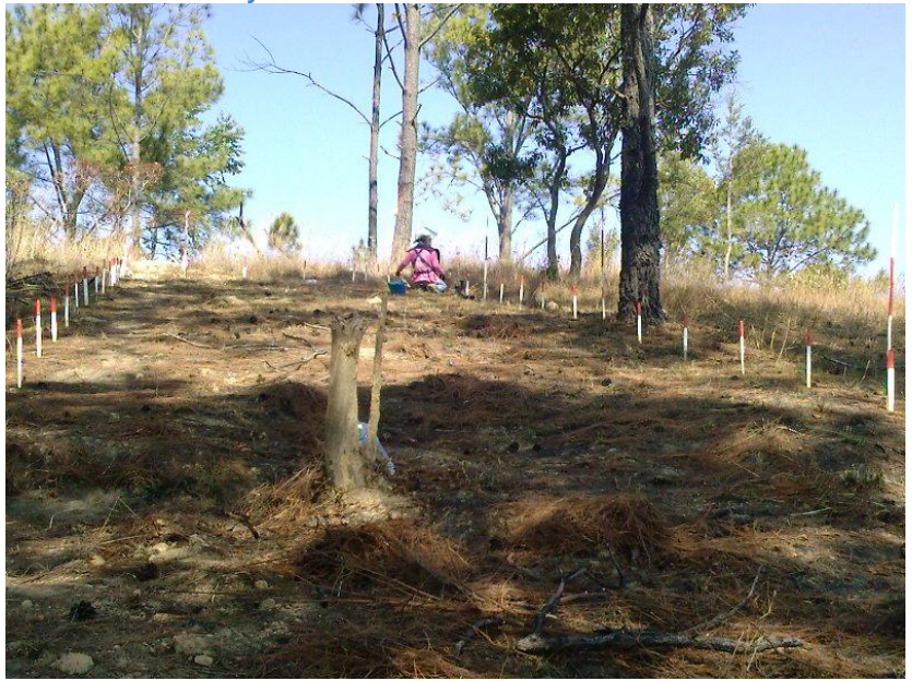
Figure 4 MIVAC Funded PCL Deminer at work "note the red and white sticks the long grass outside the sticks is a live minefield. "She's working her way through it 1 cm at a time."

Figure 3 MIVAC funded PCL Deminers heading home at the end of the day