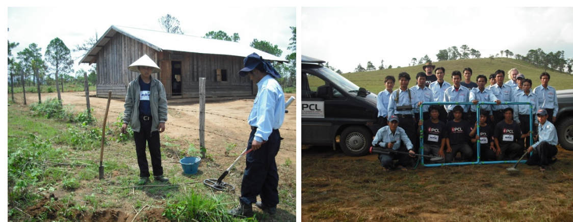
UXO clearance Ban Sai School,

On the 30<sup>th</sup> March 2009 PCL Landmine and UXO clearance teams deployed to the area to establish the task perimeter and admin areas, Minefield clearance activities starting on the 2<sup>nd</sup> April 2009.