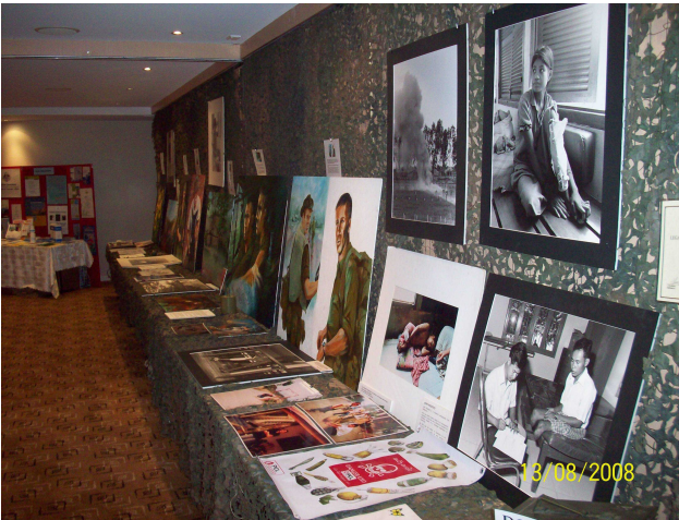
Illustration 5: Part of the exhibition at Twin Towns

Justine Elliott, Federal Minister for the Aged opened the Exhibition and several other State and Federal members also attended. Without exception they were all impressed with the work MiVAC has achieved and offered any support they were able. The full Exhibition contained displays by the Gold Coast Museum, 4 RAR Assoc., The Tracker Dogs, Explosive Detection Dogs, a contingent from SME in Sydney with a large display of mines and cluster bombs, MiVAC, Department of Veterans Affairs, and even the Provos joined in. The Exhibition was open to the public and several school's brought students along following a Legacy commemorative service in the near by park, organized by Joe Russell. Legacy presented a cheque to MiVAC for $100.00. Rob Woolley accepted the cheque on MiVAC's behalf.