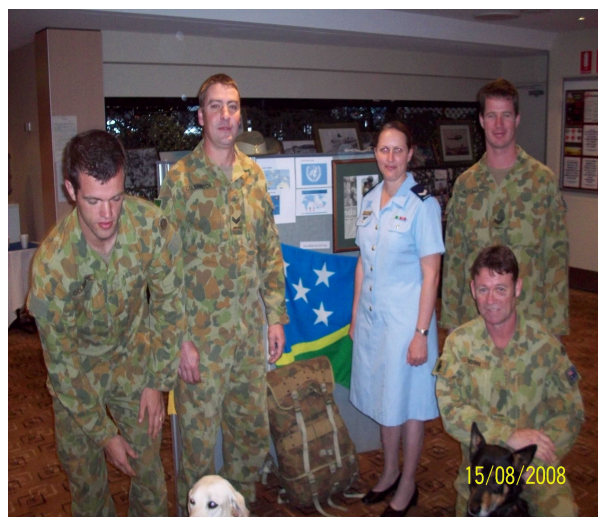
Illustration 14: Australian Army and Air Force personnel who travelled to Tweed Heads for the Exhibition plus two of Australia's finest landmine detection and guard dogs

If you would like to volunteer – in any capacity – to help MiVAC continue it's work, or to donate to any of our current projects, then please contact either Gill Paxton or Rob Woolley. The contact details for MiVAC are on Page 1.