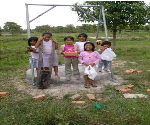
Illustration 7: Willing workers

The Orphanage management are dedicated to make the orphanage self sufficient and to get away from the dependence of donations. A recent small rural development project began that process and work is continuing to achieve self sufficiency.