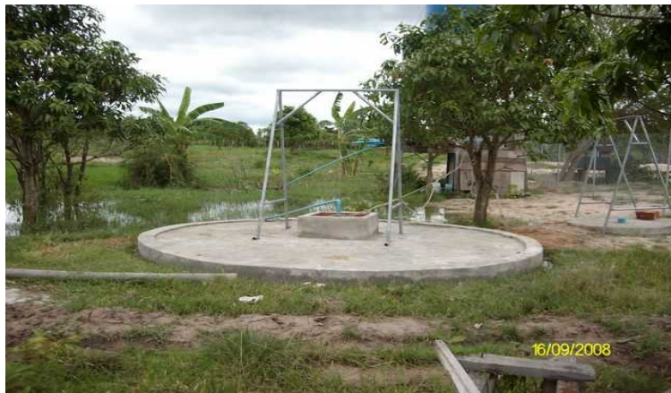
Illustration 9: Deep Well and Shallow Well No.2

This component will take some months to complete due to the sequence of construction activities/installations and hold ups due to heavy seasonal rains.