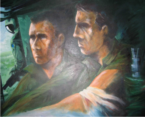
Illustration 3: Two painting by Dave Sturmer at the Vietnam War Exhibition

MiVAC has achieved to date in Cambodia and Laos. We are very grateful to all contributors who so generously allowed us to display their work.